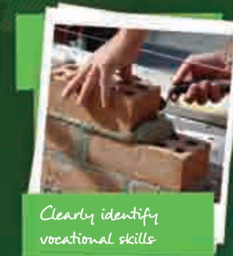
Clearly identify vocational skills